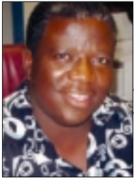
Majazi Sithole Minister for Finance

N estled between South Africa and Mozambique, the colorful Kingdom of Swaziland boasts mountain ranges, world-leading game reserves and a temperate climate that is attracting an increasing number of tourists. According to the Minister for Finance Majazi Sithole, a growing number of investors are also being drawn to the destination - the smallest country in the southern hemisphere - in search of big opportunities. "We have a stable economy where inflation is currently just over 2%, a settled government with no corruption and business opportunities enhanced by international trade agreements," he says.