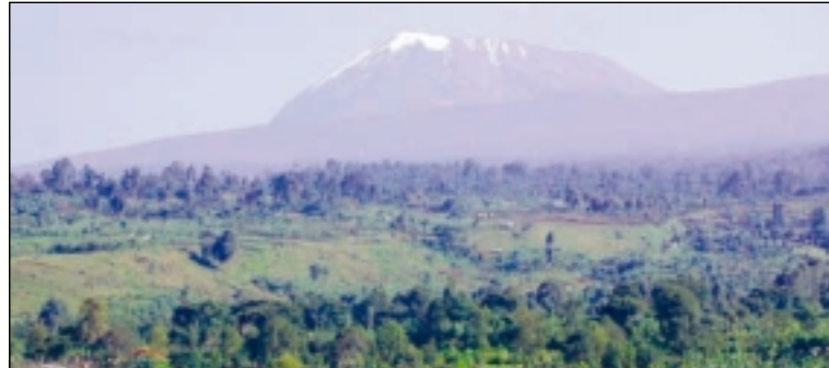
Mount Kilimanjaro – Africa's highest peak

The bank's pivotal role is set to be formalized in a new law, the Bank of Tanzania Act 2005, due to come into force later this year. The Act guarantees the bank's independence from government and cements its position as a crucial intermediary bridging the interests of government and business. Ballali says compared to the early 1990's